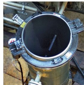
Full range of sizes