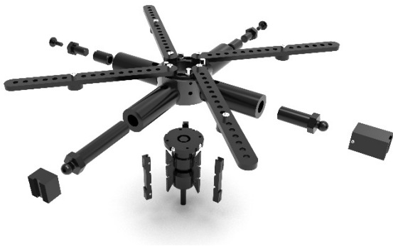
Exploded view showing all base components, collet mount and setting straps.