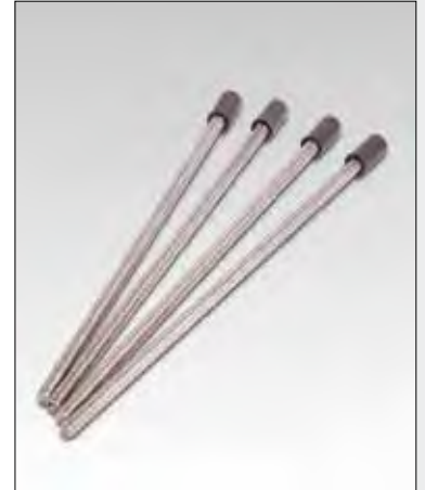
Shown: BKD71, BKD72